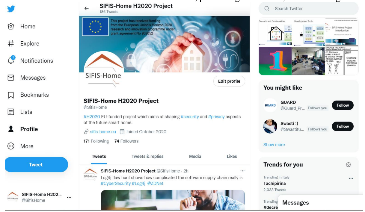
Figure 3: Screenshot of the SIFIS-Home's Twitter profile page.

and safety issues, highlighting relevant news on smart home device vulnerabilities, possible misuses of smart home services and putting the spotlight on privacy issues. Twitter has also been a way to establish connections with other H2020 projects, some of them financed under the same action of SIFIS-Home. The Twitter social channel has been active from M1, publishing 240 tweets, and collecting 87 followers.