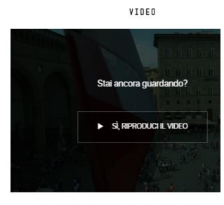
Silvio Orlando e The New Pope