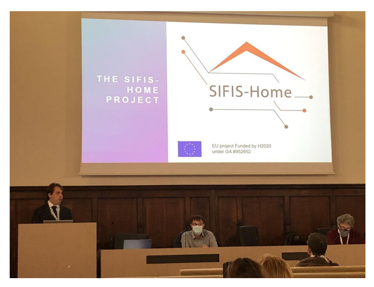
Figure 5: SIFIS-Home presentation at the Internet Festival