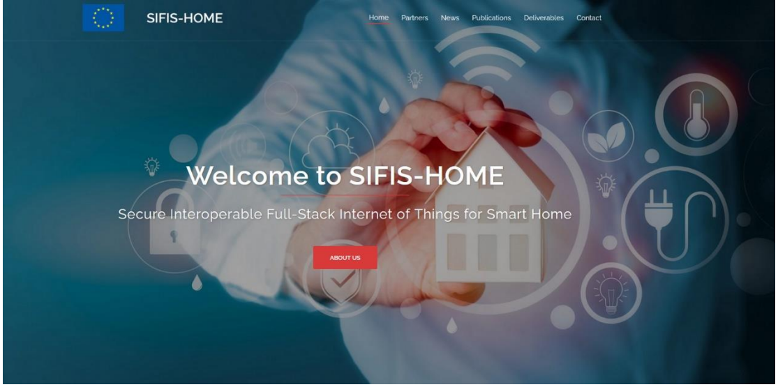
Figure 2: Home Page of the SIFIS-Home Website

The SIFIS-Home website is active from December 2020 and is updated with new contents describing the activities of the project, news from the social networks and contents published by the consortium partners through the website blog.